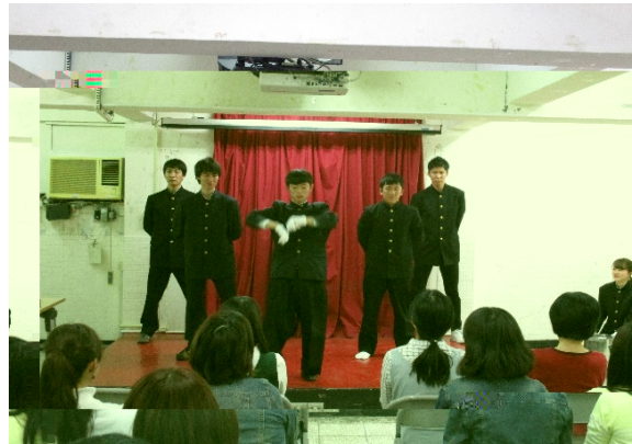
Cheer performance by students from the HU Cheer team at the completion ceremony.