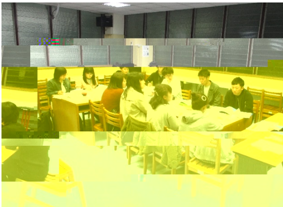
During a Chinese language lecture. Studying tenaciously during the everyday lectures produced remarkable results.