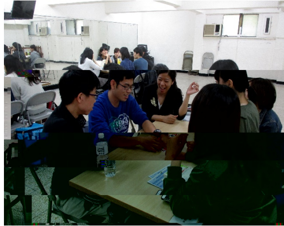
During the English luncheon; conversing in English with FJU staff and graduate students