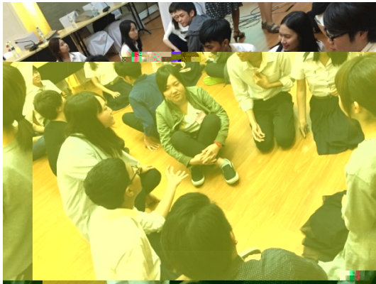
Discussion with Chulalongkorn University students

During the post-study session after returning to Japan, students gave presentations about what they had learnt during the program, and how they would utilize this experience during their student lives and in the future. Through these presentations, students were able to articulate their future goals and express clearly what they needed to do in order to achieve them.