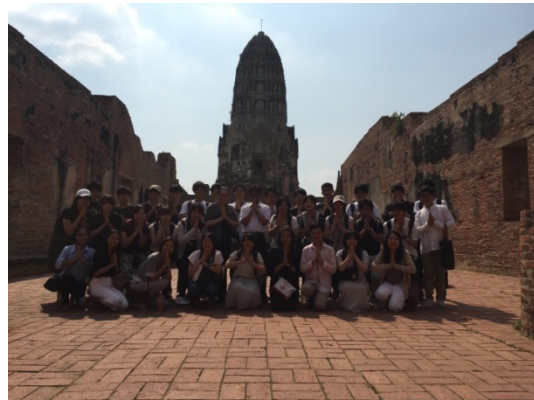
At Ayutthaya historic remains