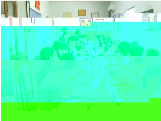
Conversing with students from the Ho Chi Minh City University of Natural Resources and Environment