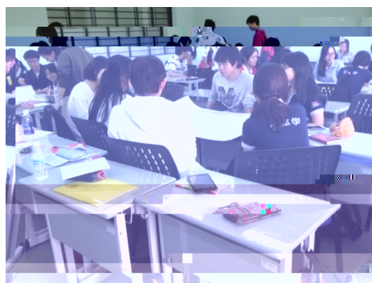
At the “What we can do to create world peace” discussion