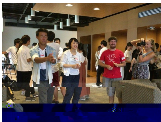
Introducing Japanese culture