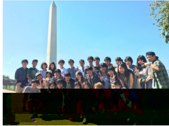
Exploring Washington D.C. on the last day of the program