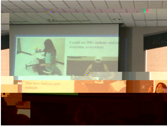
Making English presentation in groups