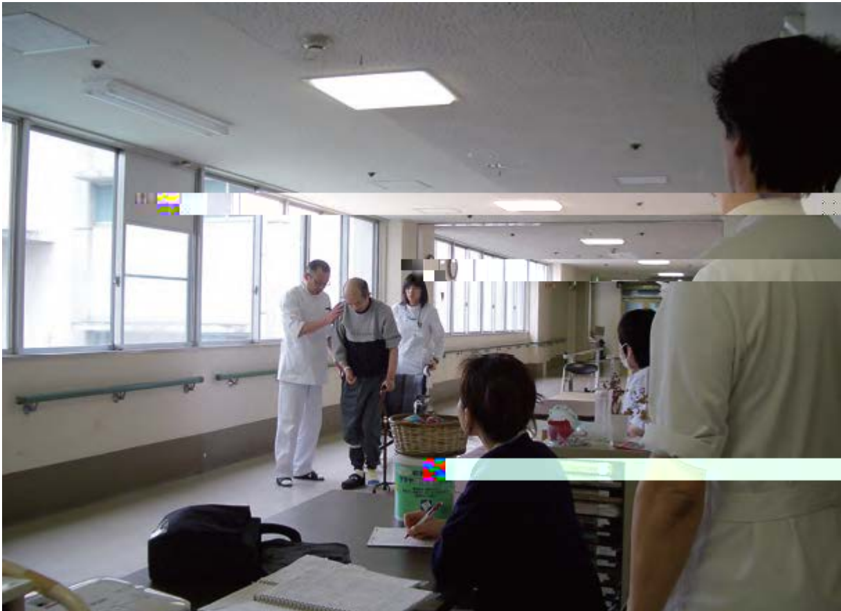
Review session for rehabilitation cases at the sub-acute rehabilitation ward