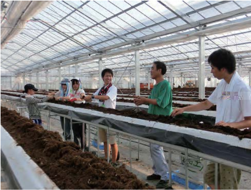
Volunteer members and a representative of a farm working together at the Yamamoto Strawberry Farm in Yamamoto Town

In affected areas, people are working long days to speed the reconstruct efforts. Some farmers strove to restore their tsunami-damaged strawberry farms because strawberries are the symbol of Yamamoto Town. In addition, we met high school students who undertook volunteer activities, with their student council playing a leading role, aimed at the reconstruction of affected areas. I hope that we will be able to continue providing emotional support to people in affected areas as well as supporting and encouraging the reconstruction efforts.