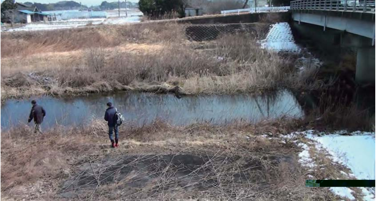
Sampling for the environmental radiation survey in Minamisoma City (March 2012)

In November 2011 and May 2012, we held debriefing sessions about the survey in Minamisoma city, which were attended by approximately 100 residents on each occasion.