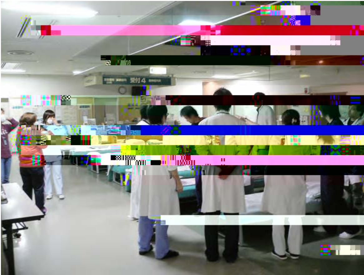
Making preparations for receiving sick and injured people

If public wireless LAN or Wi-Fi are available, they would allow us to connect to the Internet and in turn be able to obtain more accurate information in a timely manner (though batteries need to be secured).