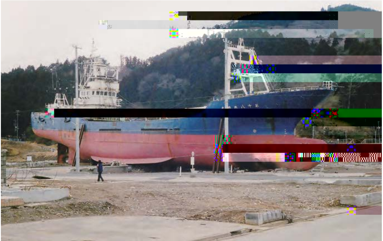
A large ship stranded next to Karakuwa Station on the Ofunato Line in the suburbs of Kesenuma City (photographed in March 2012)

at Hiroshima University, who participated in the volunteer activities, will enter the program. Within this program, I would like to stay involved in the reconstruction efforts of the affected areas by continuing to conduct fieldwork in Fukushima Prefecture.