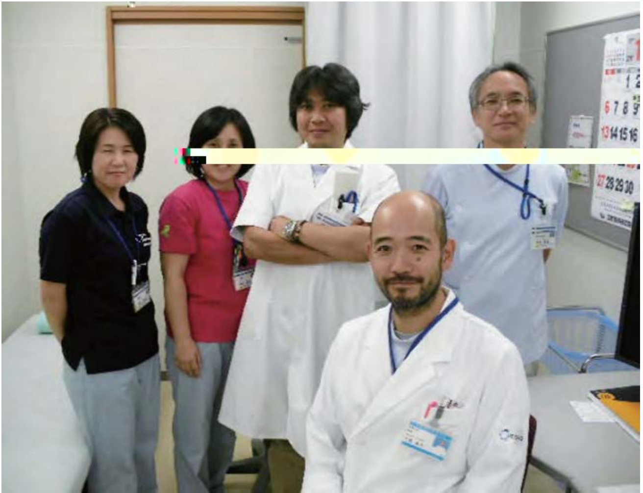
Physicians and nurses with whom the author conducted support activities (author in the center)