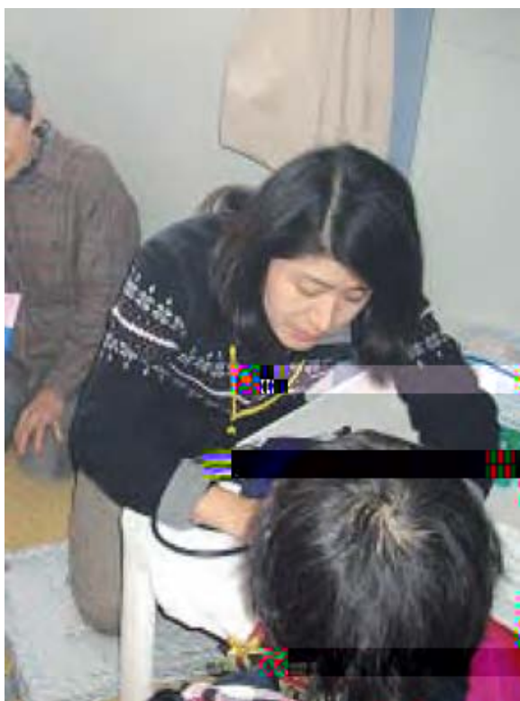
Checking health conditions at an assembly room of temporary housing in Minamisoma City

Since many of the medical facilities and their equipment were badly damaged, a new care service system needs to be developed. However, no matter how enthusiastic we are about the establishment of a new system of care, we will always be required to make adjustments in order to satisfy the immediate interest and needs of the people. At this point I feel like I have reached the limit of my ability to provide support, simply because I am unable to provide constant assistance from Hiroshima, which is so far from the affected areas.