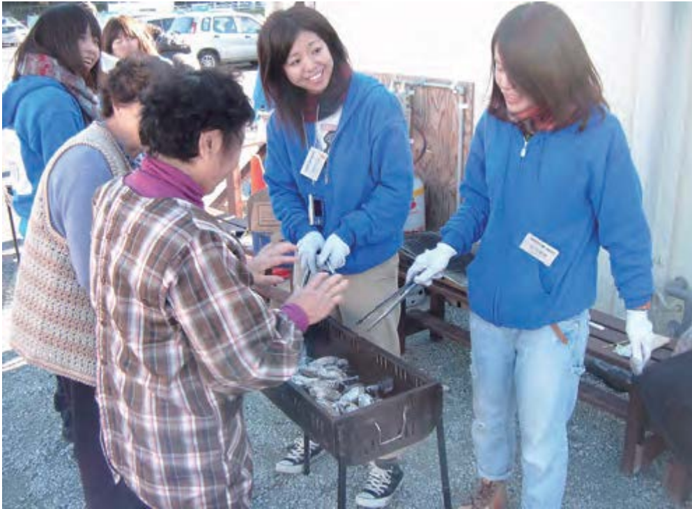
Enjoying eating together while having a chat

I would like to continue to deliver a message from the affected areas saying, “Never forget us.”