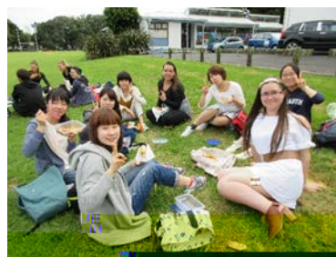
Talking with the local students