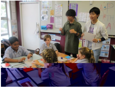
Introducing Japanese culture to elementary school children