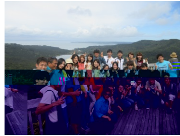
During a trip in the outskirts of Auckland