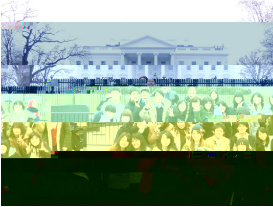
In front of the White House