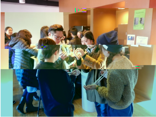
Teaching a traditional Japanese game