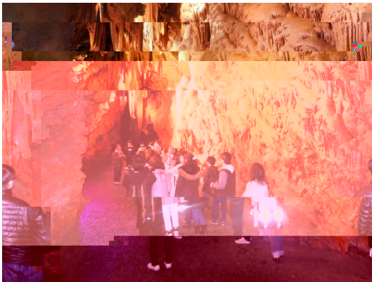
Venturing into the Shenandoah Caverns