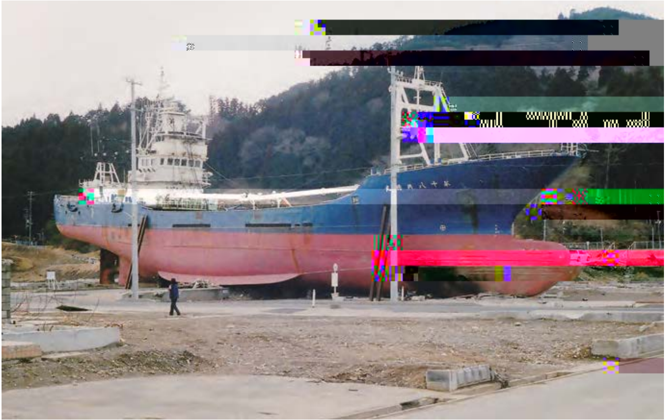
A large ship stranded next to Karakuwa Station on the Ofunato Line in the suburbs of Kesenuma City (photographed in March 2012)

at Hiroshima University, who participated in the volunteer activities, will enter the program. Within this program, I would like to stay involved in the reconstruction efforts of the affected areas by continuing to conduct fieldwork in Fukushima Prefecture.