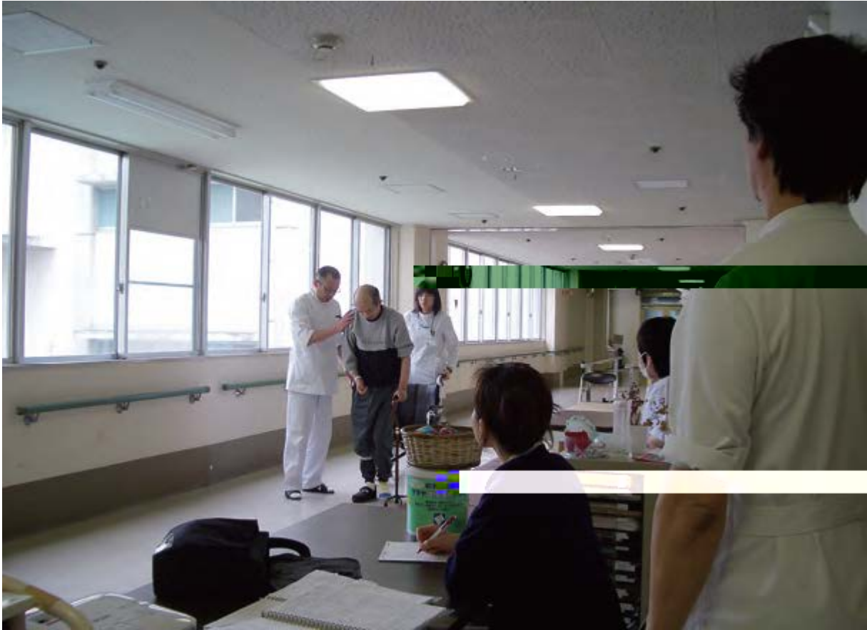
Review session for rehabilitation cases at the sub-acute rehabilitation ward