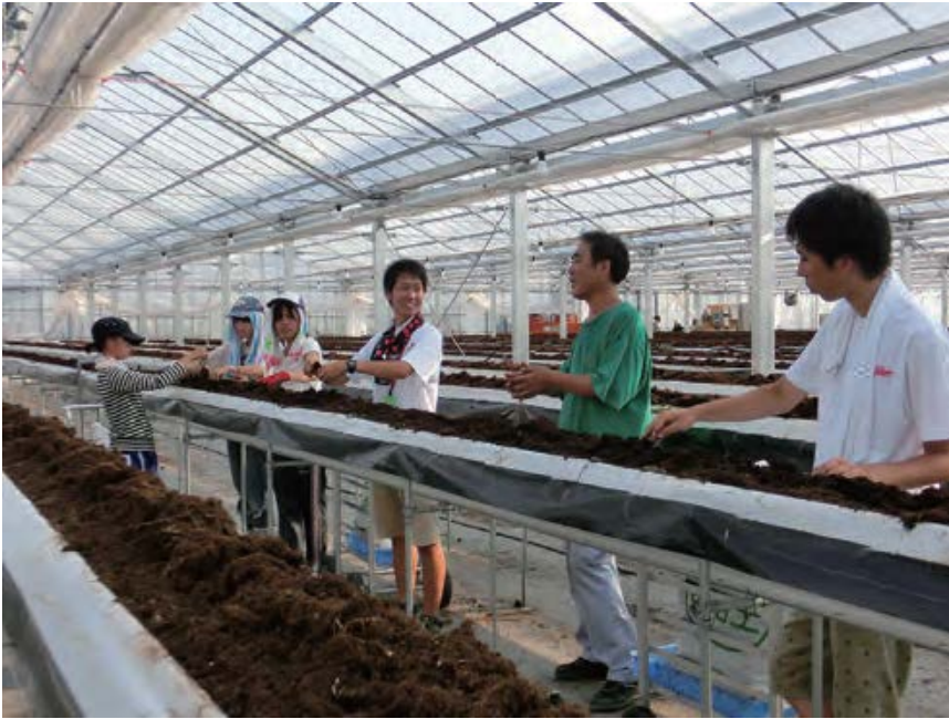
Volunteer members and a representative of a farm working together at the Yamamoto Strawberry Farm in Yamamoto Town

In affected areas, people are working long days to speed the reconstruct efforts. Some farmers strove to restore their tsunami-damaged strawberry farms because strawberries are the symbol of Yamamoto Town. In addition, we met high school students who undertook volunteer activities, with their student council playing a leading role, aimed at the reconstruction of affected areas. I hope that we will be able to continue providing emotional support to people in affected areas as well as supporting and encouraging the reconstruction efforts.