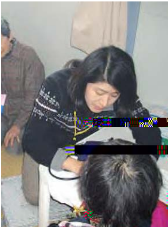
Checking health conditions at an assembly room of temporary housing in Minamisoma City

Since many of the medical facilities and their equipment were badly damaged, a new care service system needs to be developed. However, no matter how enthusiastic we are about the establishment of a new system of care, we will always be required to make adjustments in order to satisfy the immediate interest and needs of the people. At this point I feel like I have reached the limit of my ability to provide support, simply because I am unable to provide constant assistance from Hiroshima, which is so far from the affected areas.