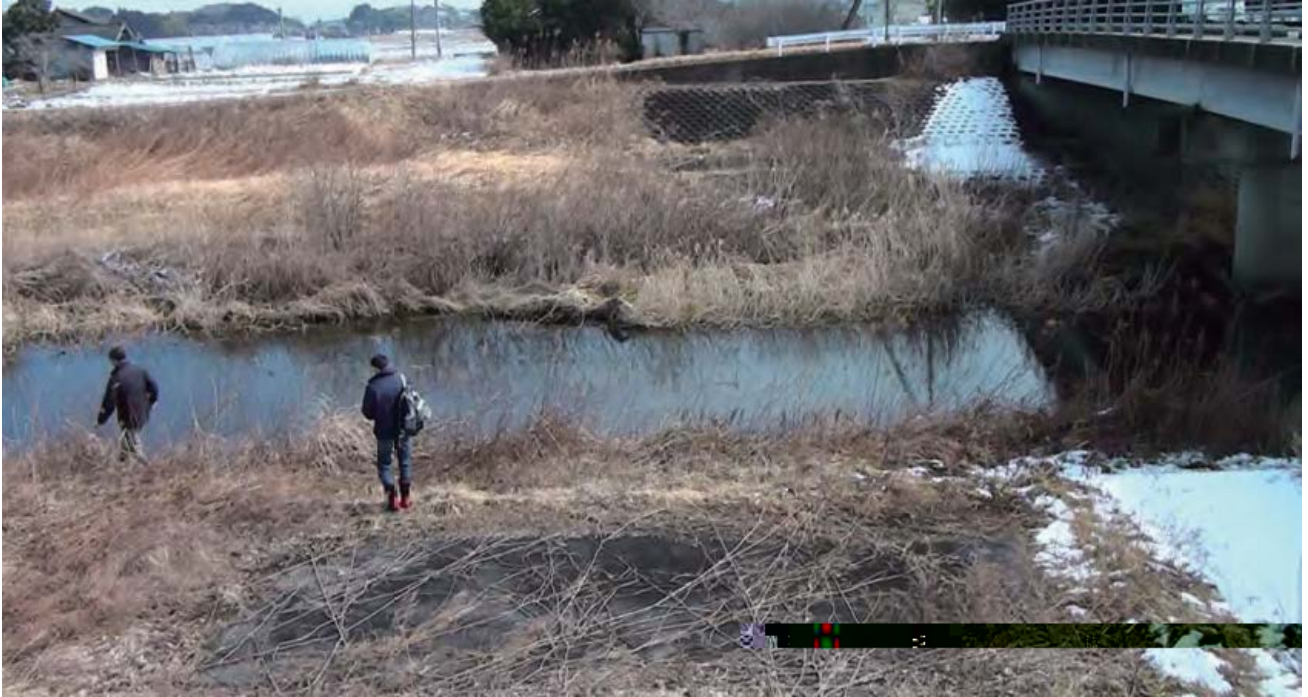
Sampling for the environmental radiation survey in Minamisoma City (March 2012)

In November 2011 and May 2012, we held debriefing sessions about the survey in Minamisoma city, which were attended by approximately 100 residents on each occasion.