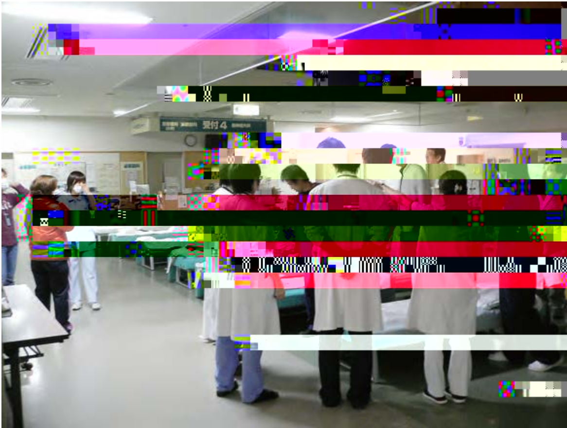
Making preparations for receiving sick and injured people

If public wireless LAN or Wi-Fi are available, they would allow us to connect to the Internet and in turn be able to obtain more accurate information in a timely manner (though batteries need to be secured).