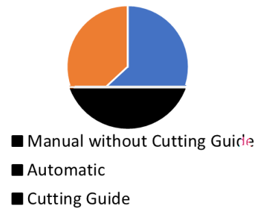
Cutting area of cargo hall 2