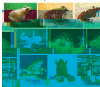
Institute for Amphibian Biology