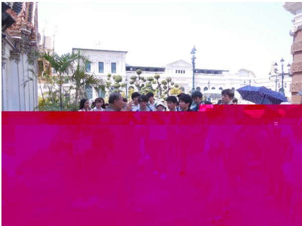
Visiting a historic and cultural establishment in Bangkok City (Grand Palace)