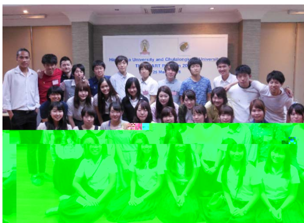
Interacting with the local students at Chulalongkorn University

After returning to Japan, the students gave presentations on what they had learned via their participation in the program, or about how they wish make use of what they had learned in the program when moving forward (e.g., in school or in the future), and were able to reaffirm their goals, and their concrete plans for how to achieve such goals.