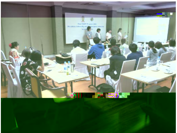
Final presentation ceremony