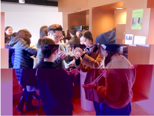
Teaching a traditional Japanese game