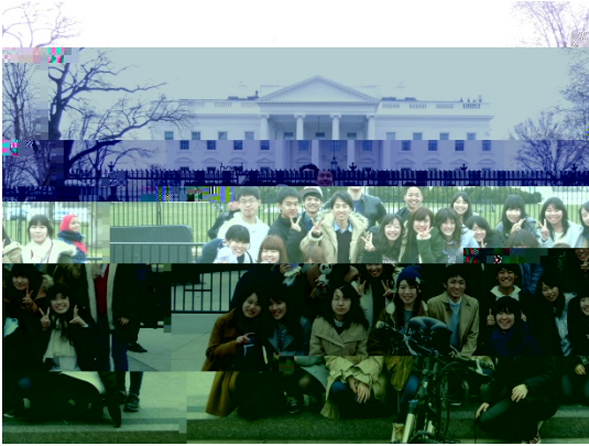
In front of the White House