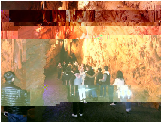
Venturing into the Shenandoah Caverns