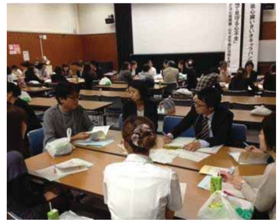
Heart Health Caravan Workshop sessions

Centered around the Cardiac Failure Center of Hiroshima University Hospital, a network has been established with the heart health centers of six hospitals in Hiroshima Prefecture (Asa Citizens Hospital, Chugoku Rosai Hospital, JA Onomichi General Hospital, Miyoshi Medical Association Hospital, Fukuyama City Hospital, and JA Hiroshima General Hospital) to provide region-wide health services for cardiac failure patients, including post-attack cardiac rehabilitation programs and health