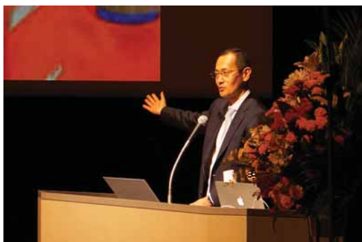
Lecture by Nobel Laureate, Professor Shinya Yamanaka

The Basic Policy for Strengthening the Research Abilities of the University sets as a goal to “create competitive environments to retain and develop excellent researchers.” To achieve this goal, the University has designed a personnel evaluation system that encourages faculty members to demonstrate their maximum abilities, by expressing the evaluation results by score points and determining their compensation based on these scores. In fiscal 2014, it was stipulated in the basic policy to add international research activities as a key evaluation element and reflect the results of the evaluation of these activities into the compensation of the researchers.