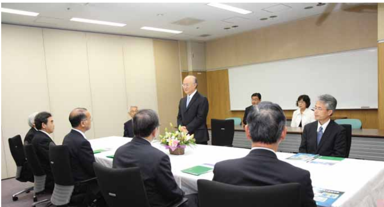
Yukiya Amano ( Director General of the International Atomic Energy Agency ) Visited Hiroshima University

The University, as a regional tertiary medical center for radiation exposure, has reinforced its collaboration with relevant parties. The local radiation emergency medical preparedness and assistance network was established between prefectures in Western Japan that have nuclear power plants and neighboring prefectures. As a collaborative program with this network, the Hospital has dispatched lecturers to nuclear disaster drills carried out in these prefectures. In addition, training programs and decontamination drills have been provided to educate and provide information on emergency medical care for radiation exposure. The Hospital also actively participates in the Response and Assistance Network (RANET) established by the International Atomic Energy Agency (IAEA).