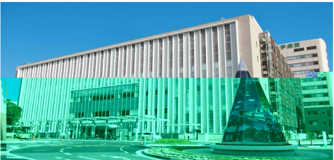
Hiroshima University Hospital

The construction of a new medical service building was completed in fiscal 2013. Upon the move to the new building, the outpatient and medical service sections of the medical and dentistry departments were concentrated, surgery rooms were added (from 13 to 17), the chemotherapy rooms were expanded (from 14 to 28 beds), new surgical intensified care units (SICUs) designed exclusively for post-operation were added (six beds) and other actions were made to reinforce the functions of the medical service. Moreover, the new medical service building also houses the “Futuristic Medical Care Center,” engaged in cell therapy, regenerative medicine and other advanced medical care; and the “Sports Medical Center,” which serves the particular needs of the area as the home town of a professional baseball team and a professional soccer team. By developing translational medicine and practicing advanced medicine, the Hospital has been developing a system to reflect research results into its medical practice.