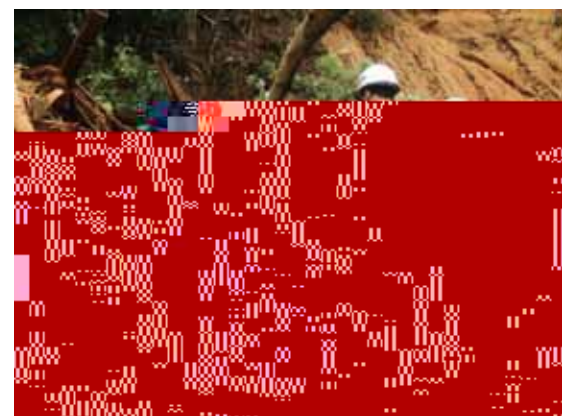
Disaster Medical Assistance Team (DMAT)

In November of the same year, the Hospital held a meeting with representatives from the administrative departments, the fire departments of Hiroshima, Yamaguchi and Shimane Prefecture, and hospitals that are to serve as medical centers in the event of disaster in these prefectures, to discuss the effectiveness of DMAT activities in coping with the landslide disaster in Hiroshima City. Through these activities, the Hospital has played a core role in regional disaster medical care.