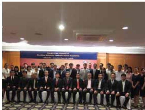
Inauguration Ceremony of Hiroshima University Cambodia Alumni Association

The number of overseas locations has increased from six locations (in five countries) in fiscal 2010 to 11 locations (in nine countries), including the Bandung Center in Indonesia. The University implemented the Study in Japan Fair in these overseas locations. From about 100 to 800 local students participated in these fairs in each location. In fiscal 2014, the University developed a proposal for globalization utilizing the networks of overseas locations and overseas alumni associations. It has worked to strengthen the functions of these overseas locations to promote globalization through collaboration with overseas alumni associations.