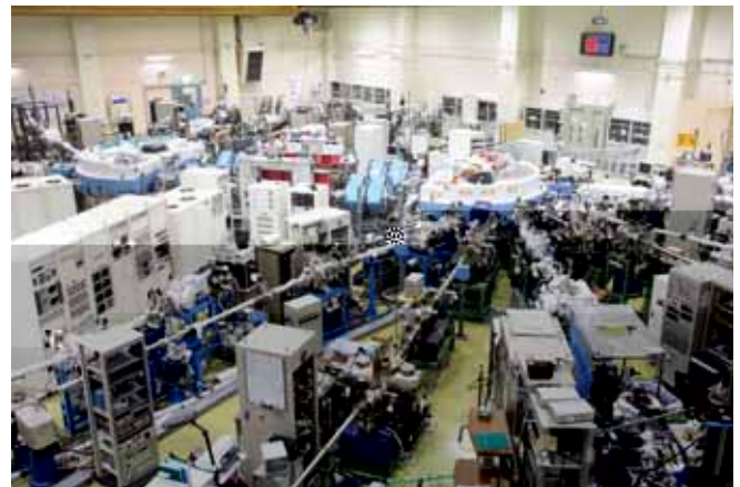
Hiroshima Synchrotron Radiation Center

At the Hiroshima Synchrotron Radiation Center, the newest quasi-periodic variably polarizing undulator, generating extremely strong radiation light, was installed for “research of the fine electronic structure” in Physicality II, which resulted in the discovery of a new topological insulator, a new superconductive state via orbital fluctuation, and a rule that exists between the strength of electron pairs bearing superconductivity and the superconductivity transition temperature. In the “research of physical properties of quantum spin” project, activities to pursue pioneering achievements have been conducted, including research for the creation of a high-efficiency spin-and-angle-resolved photoemission spectrometer.