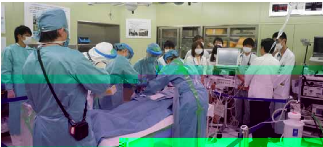
Provision of a clinical training environment for graduates

A questionnaire-based survey was conducted among residents. Based on the results of the survey, changes in trends in career path desire were analyzed, and training programs were revised and working conditions for residents were improved accordingly. A clinical training environment for graduates has been provided, including training seminars designed for residents in the first and second years, which are held about twice a month. As a regional tertiary medical center for radiation exposure, the Hospital has had doctors, nurses, clinical radiation technologists and other medical service providers participate in overseas training programs and special seminars in order to produce medical practitioners who can provide emergency medical care and service for radiation exposure.