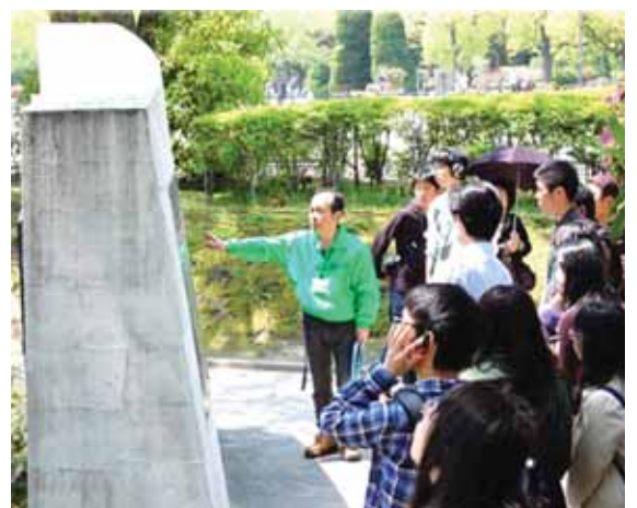
peace-building activities in collaboration with the local government

In fiscal 2013, the Hiroshima Initiative to Nurture a Peaceful Society for All People was designated by the MEXT as a Center of Communities (COC) project. This Initiative has provided educational programs in collaboration with the local government, such as community-based experience-type learning in liberal art seminars and internship programs. In particular, in addition to “peace education lectures” that all students must take, the University has established educational courses to broaden the understanding of students of communication on peace messages throughout their years at the University and has provided opportunities to participate in activities related to peace building, as part of student activities to address problems faced by the Hiroshima Peace Memorial Museum and to pass on the reality of exposure to radiation to future generations.