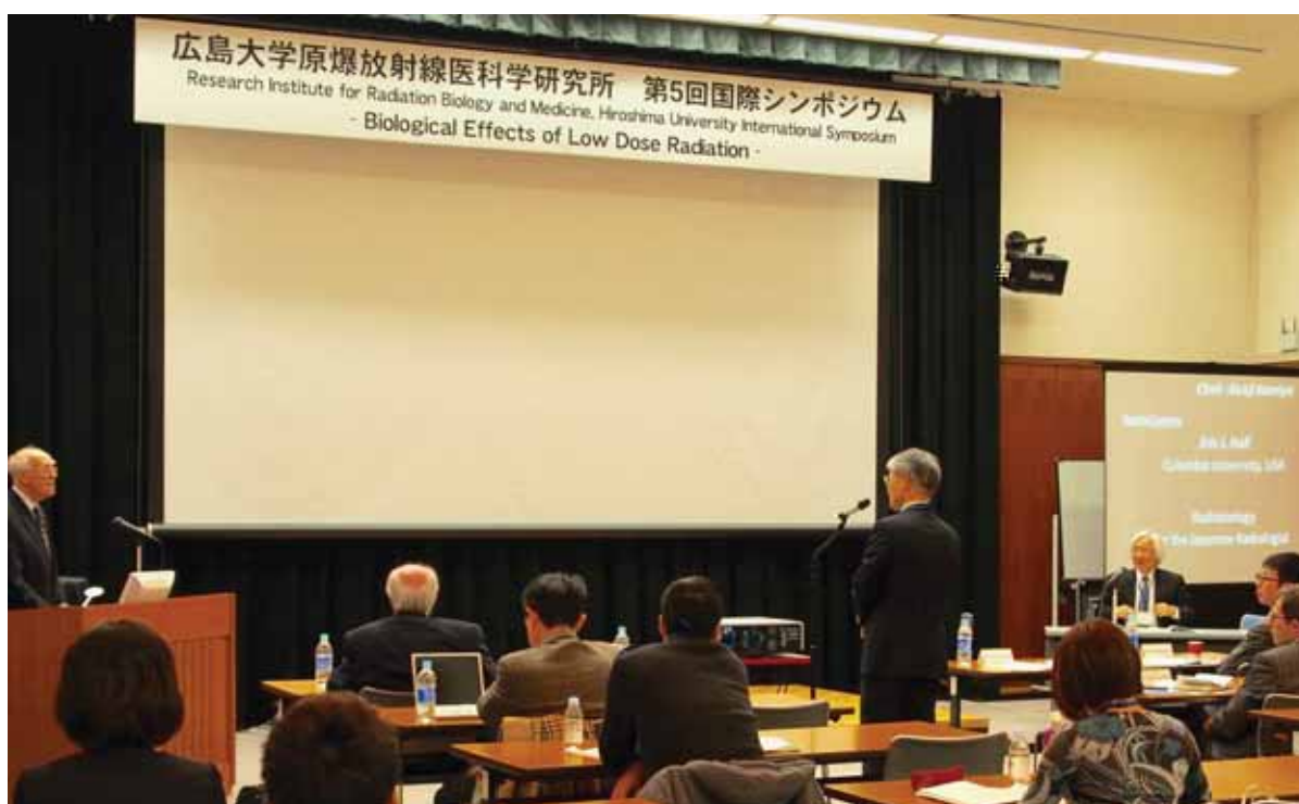
Research Institute for Radiation Biology and Medicine , Hiroshima University International Symposium -Biological Effects of Low Does Radiation-

The Research Institute for Radiation Biology and Medicine promoted collaboration with other institutes in establishing international education and research centers for radiation disaster medicine. Two facilities of this research institute, which were designated as centers for joint usage and joint research activities, were evaluated as “A” at the end of the period. These activities have also led to the designation of the “Research Base for Radiation Accidents and Medical Science,” a network of joint usage and research centers with Nagasaki University and Fukushima Medical University for the Third Medium-Term Period (fiscal 2016 to 2021).