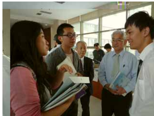
Study in Japan Fairs: Six Universities in the Chugoku and Shikoku Regions

The University has actively accepted foreign students. At the Beijing Research Center and other overseas locations of the University, the University has conducted admission examinations of foreign students, sessions of the “Study in Japan Fairs: Six Universities in the Chugoku and Shikoku Regions,” explanation meetings relating to the Graduate School of Hiroshima University, and other activities. Moreover, in response to the globalization of the University, online application was introduced in fiscal 2014. As a result of these activities, the number of foreign students has increased from 341 in fiscal 2010 to 406 in fiscal 2015. In particular, students from countries where the University has local centers have increased from 181 to 278.