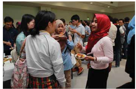
“Cross-cultural Exchange Event” with International Students