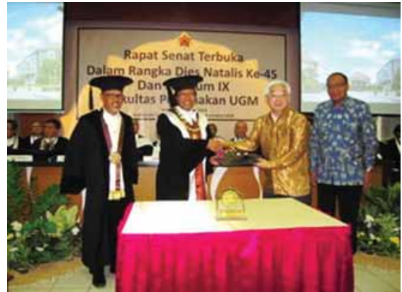
The Graduate School of Biosphere Science ( HiroshimaUniversity ) has concluded international exchange agreements with Faculty of Agriculture ( Gadjah Mada University )

The Graduate School of Biosphere Science, the School of Applied Biological Science established the Research Center for Animal Science in fiscal 2013 and the Research Center for Japanese Foods in fiscal 2014, as incubation research centers of Hiroshima University. By conducting international symposiums and seminars, these centers have promoted collaborative research activities with overseas institutes. The number of granted patents increased from 17 during the First Medium-Term Period (fiscal 2004 to 2009) to 109 during the Second Medium-Term Period (fiscal 2010 to 2015).