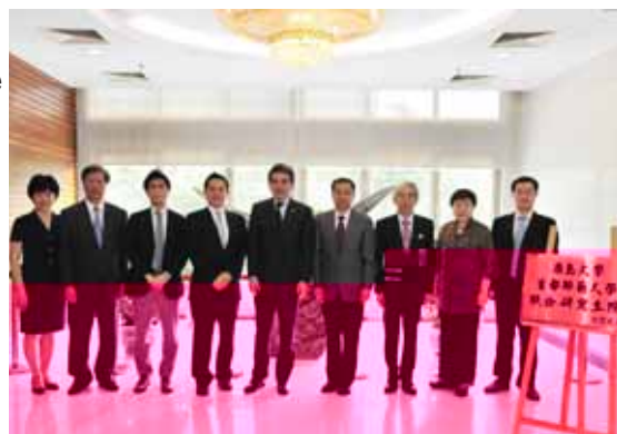
The Plaque Unveiling Ceremony of Hiroshima University and Capital Normal University's Joint Graduate School Program

In terms of the numbering of subjects, 90.4% of all courses were assigned identification numbers as of the end of fiscal 2015. Some 82.0% of syllabuses had English translations. Although 100% was not achieved in these elements, the implementation rate for international recruitment was 100% for new faculty members employed on April 1, 2016. The number of foreign students increased by 13.2% from fiscal 2013 to fiscal 2015, and students dispatched to overseas affiliated universities increased by 12.5%, both figures exceeding the targets.