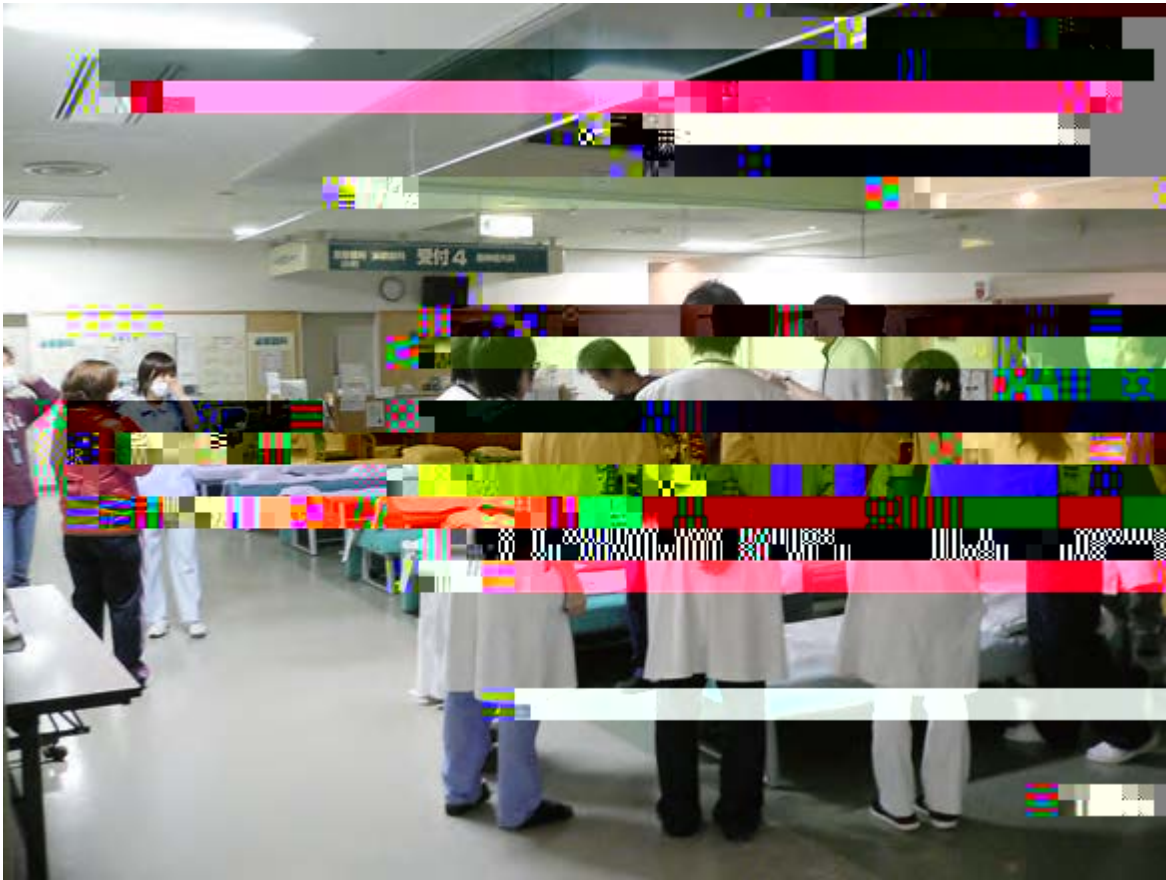
Making preparations for receiving sick and injured people

If public wireless LAN or Wi-Fi are available, they would allow us to connect to the Internet and in turn be able to obtain more accurate information in a timely manner (though batteries need to be secured).