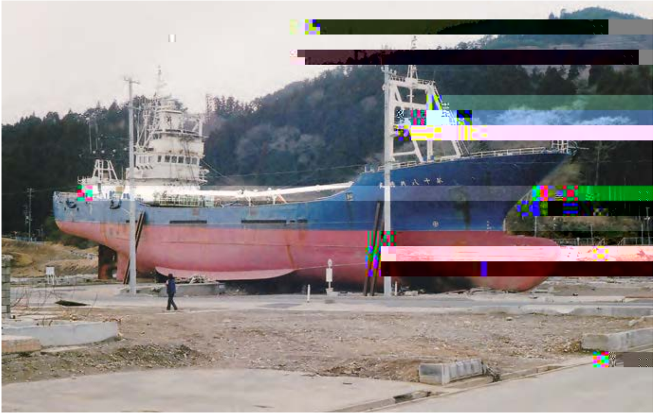
A large ship stranded next to Karakuwa Station on the Ofunato Line in the suburbs of Kesenuma City (photographed in March 2012)

at Hiroshima University, who participated in the volunteer activities, will enter the program. Within this program, I would like to stay involved in the reconstruction efforts of the affected areas by continuing to conduct fieldwork in Fukushima Prefecture.