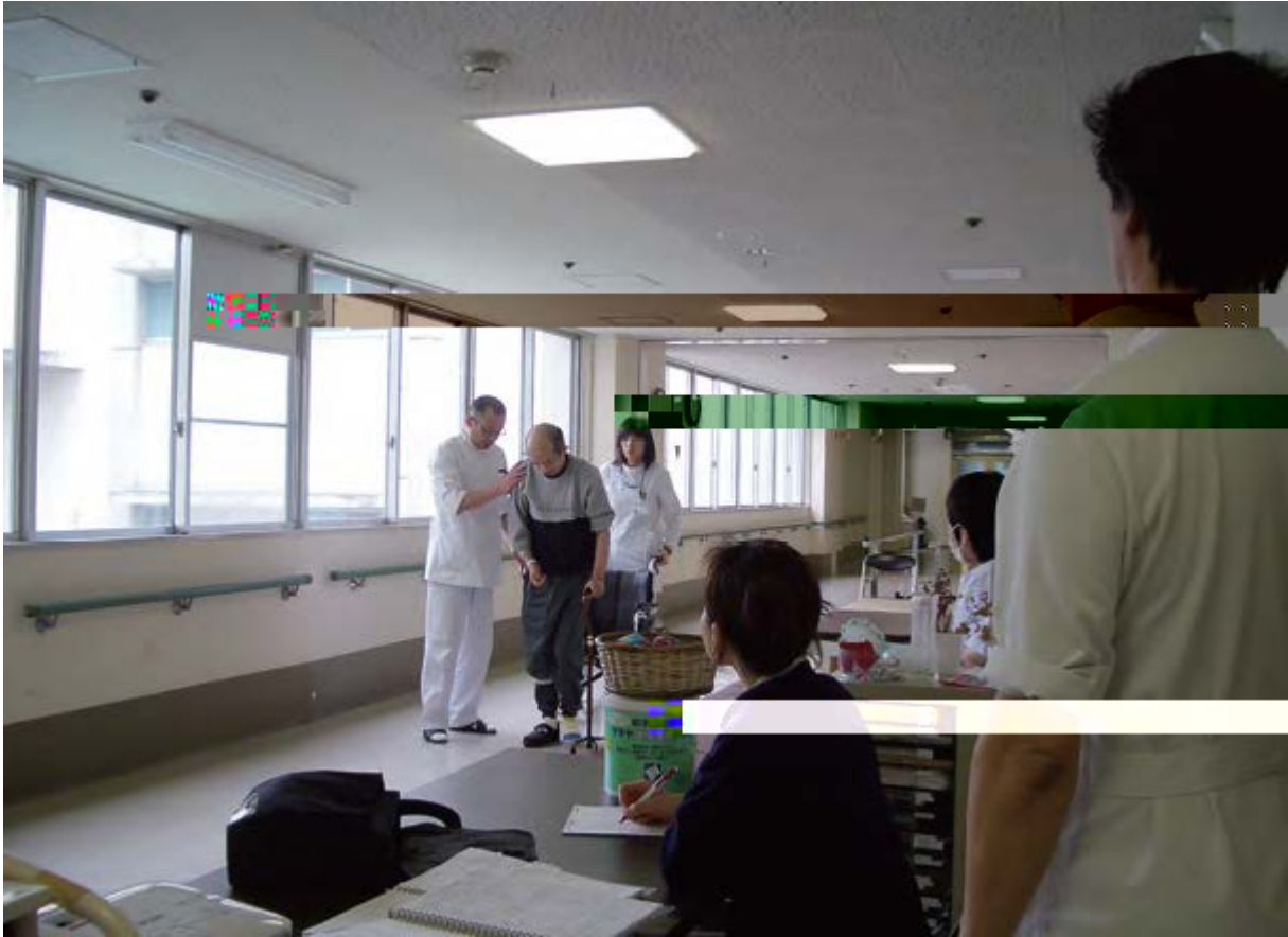
Review session for rehabilitation cases at the sub-acute rehabilitation ward