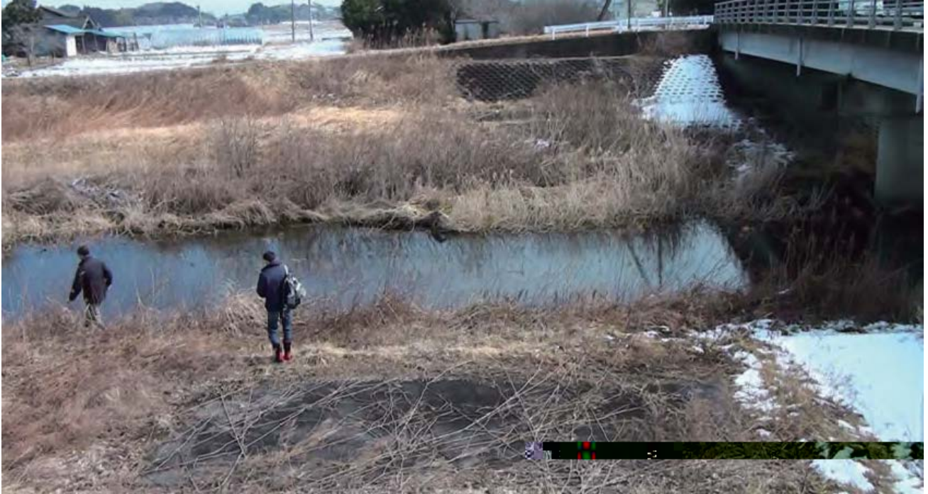
Sampling for the environmental radiation survey in Minamisoma City (March 2012)

In November 2011 and May 2012, we held debriefing sessions about the survey in Minamisoma city, which were attended by approximately 100 residents on each occasion.