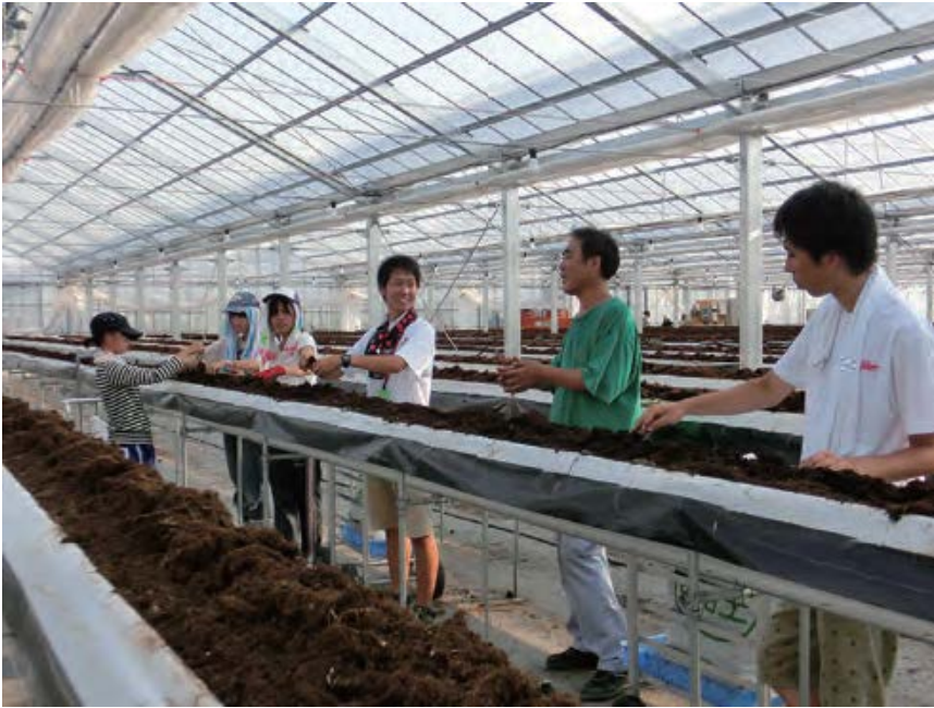
Volunteer members and a representative of a farm working together at the Yamamoto Strawberry Farm in Yamamoto Town

In affected areas, people are working long days to speed the reconstruct efforts. Some farmers strove to restore their tsunami-damaged strawberry farms because strawberries are the symbol of Yamamoto Town. In addition, we met high school students who undertook volunteer activities, with their student council playing a leading role, aimed at the reconstruction of affected areas. I hope that we will be able to continue providing emotional support to people in affected areas as well as supporting and encouraging the reconstruction efforts.