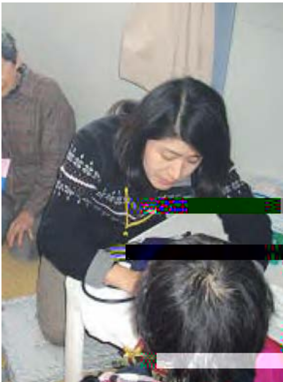
Checking health conditions at an assembly room of temporary housing in Minamisoma City

Since many of the medical facilities and their equipment were badly damaged, a new care service system needs to be developed. However, no matter how enthusiastic we are about the establishment of a new system of care, we will always be required to make adjustments in order to satisfy the immediate interest and needs of the people. At this point I feel like I have reached the limit of my ability to provide support, simply because I am unable to provide constant assistance from Hiroshima, which is so far from the affected areas.