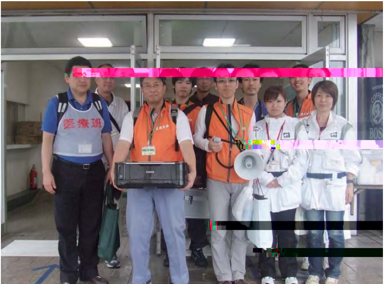
Support team for temporary return home