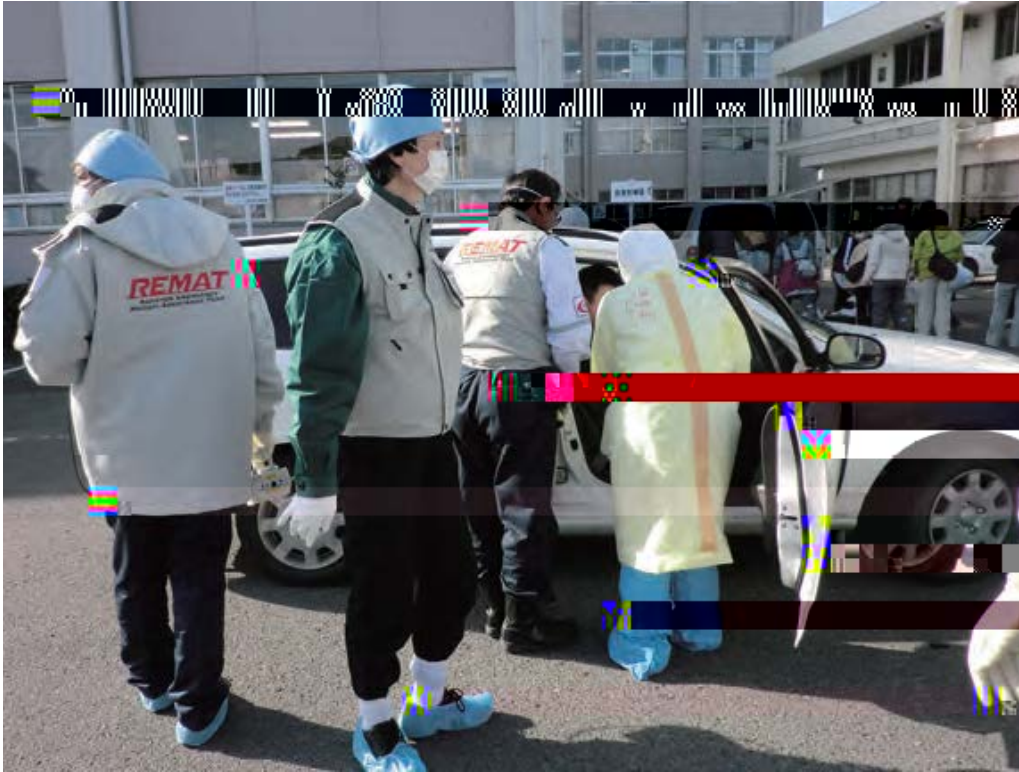
Screening of people evacuated from the Fukushima No. 1 nuclear power plant (At the Soso Public Health Center in Minamisoma City on March 14)

From the end of May through the middle of September 2011, medical examinations for police officers and firemen were conducted at Fukushima Medical University every week to check their internal radiation exposure, using the Whole Body Counter. I participated in the medical examinations in order to explain their results. In August 2011, I launched WBC examinations at Hiroshima University, targeting evacuees from Fukushima Prefecture. Since July 2012, I have provided outpatient care and given counseling on radiation-related issues at the Minamisoma City General Hospital.