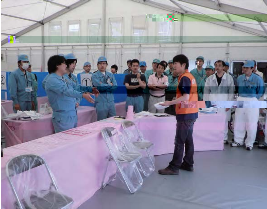
Adjustments being made with the Federation of Electric Power Companies of Japan at a “hot” zone

I was very happy to participate in support activities for the evacuated residents' temporary return home program as a member of the medical staff. I always took care to conduct activities with respect for the residents and tried to view things from their perspective. At first, the local residents made many complaints. However, over time these complaints gradually decreased because individual institutions made a concerted effort to hold discussions before the actual home visits, which strengthened their sense of unity. This made me fully realize the importance of communication.