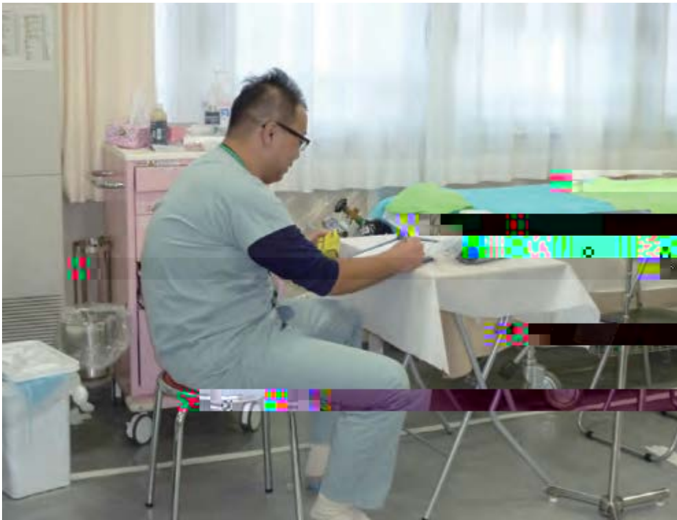
Checking medicines in 5/6 ER