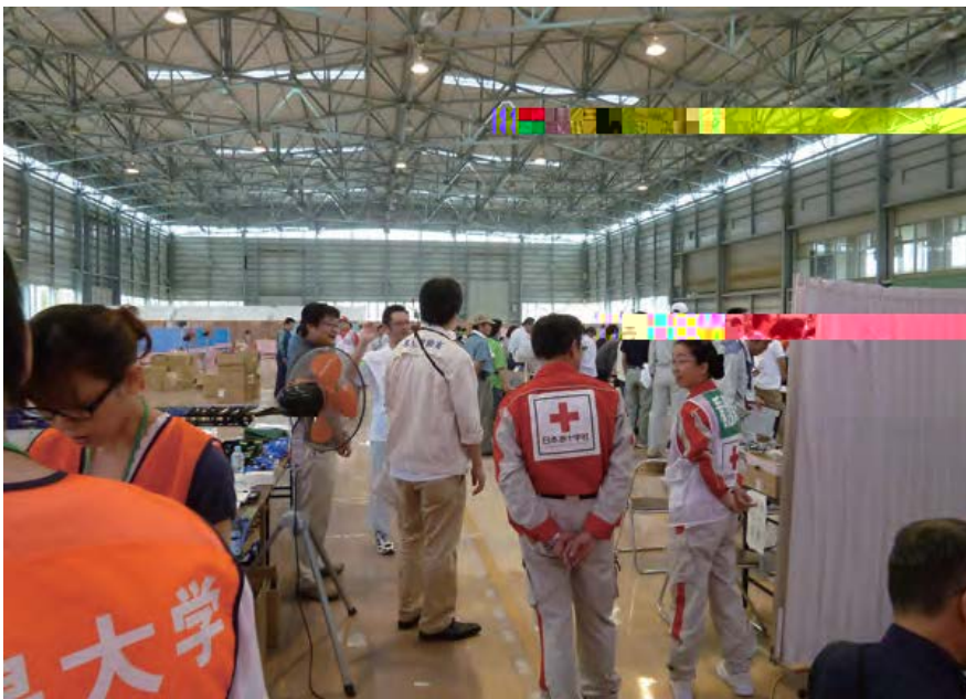
Staff making preparations for reception of residents at the venue for temporary return home

Staff members formed teams and took turns joining support activities. In some cases when all of the team members were being rotated concurrently, new members had trouble carrying out operations because none of them were completely familiar with the proper flow of operations. In addition, in the beginning it took a long time to coordinate activities with other teams (Ministry of Economy, Trade and Industry, Federation of Electric Power Companies of Japan, etc.). I believe that in a situation like this, the most important points are cooperation and communication among individual organizations beyond the boundaries of job categories.