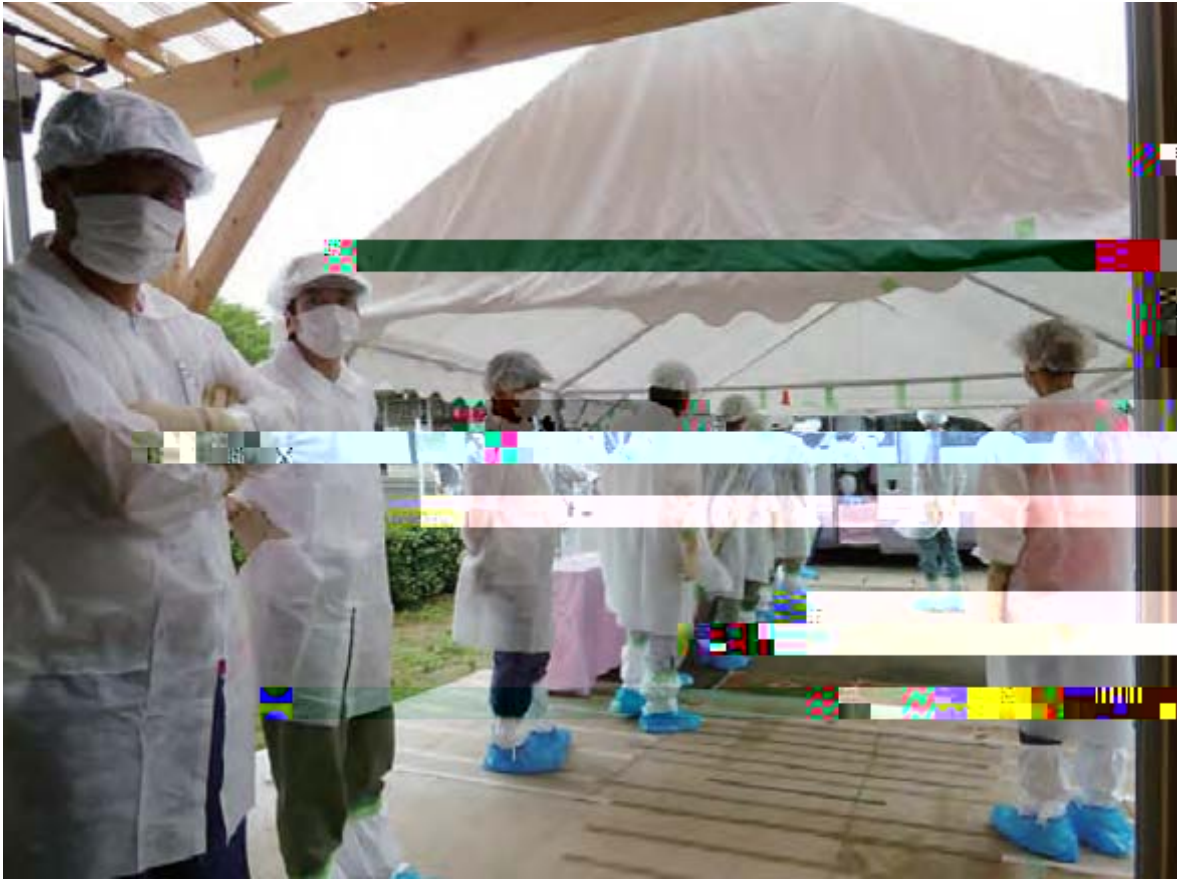
Arrival site for buses for the temporary return home (Baji Park in Minamisoma City)