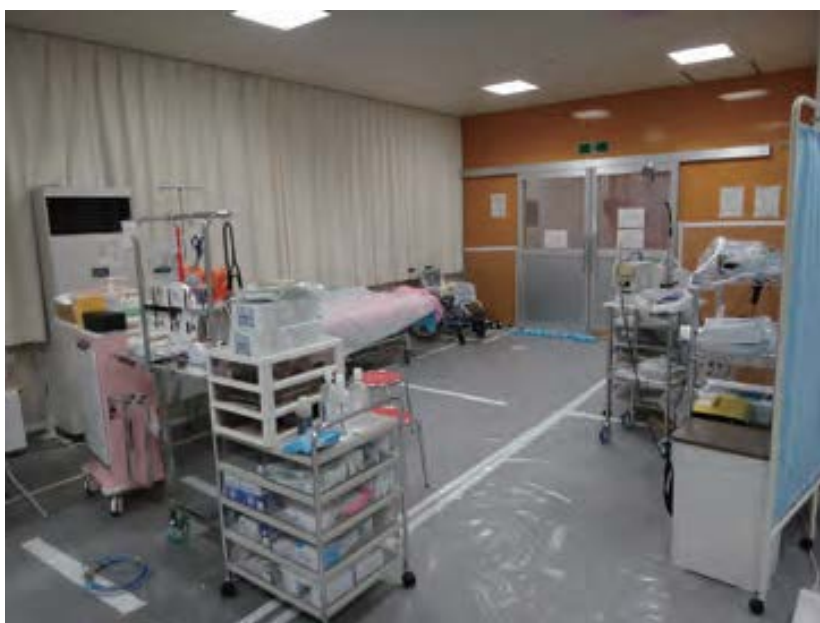
Emergency medical room in the Fukushima No. 1 nuclear power plant, equipped with devices available for emergency response operations

It has been nearly two years since the earthquake, and memories of the earthquake are now fading away from people's consciousness. However, whenever I pass through evacuation areas to visit the Fukushima No. 1 nuclear power plant, I realize that there are still so many people in Fukushima who cannot return to their normal lives. Hiroshima University will continue to provide support until all residents regain their old lives as they were prior to the earthquake. As a staff member of Hiroshima University, I will continue to keep visiting Fukushima in order to continue contributing to the post-quake recovery no matter how small the contribution may be.