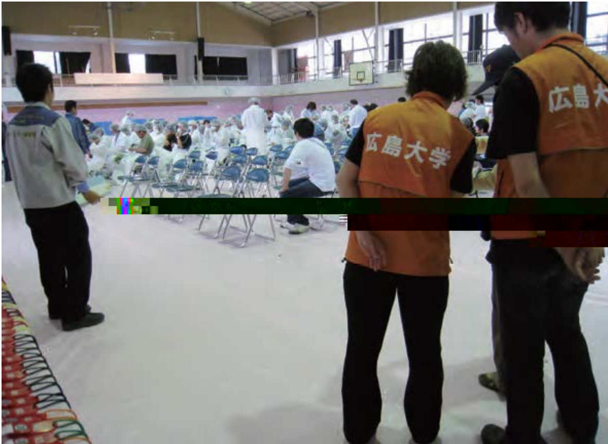
Staging venue (residents putting on protection suits)

Through these activities, I gained a new appreciation of the importance of understanding individual roles and their respective purpose. Furthermore, it is important to clarify what needs to be done given such a confusing situation. With this in mind, I believe that we should conduct training on a routine basis, simulating what roles we should play and what is likely to be lacking during these types of emergency situations.