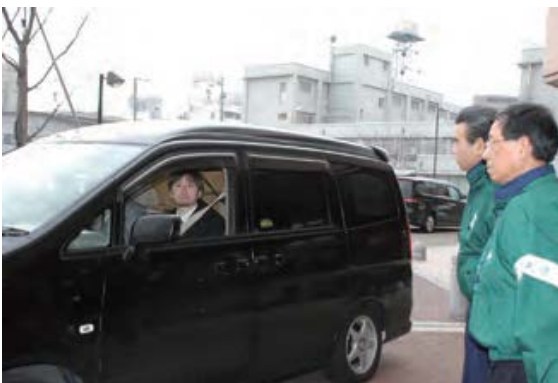
A public vehicle leaving Hiroshima University Hospital with a full load of relief supplies (March 15, 2011)

When I was requested to provide logistical support, I felt a little uneasy because I was not sure what was going on in Fukushima nor where I would stay. In addition, I heard about the nuclear power plant accident. However, I was accustomed to long-distance driving, am someone who is able to sleep anywhere, and did not have much knowledge about the risk of radiation. Therefore, I believed that I was suitable for this job. Although I was not sure that I could get the job done efficiently, I readily agreed to the request without asking anything further questions, because I believed that this would provide a good opportunity for a simple person like me to be helpful during an emergency situation. Additionally, since I am involved in disaster-prevention measures through an association at my workplace which deals with risk management, this was a great experience. I sincerely hope all the affected areas will recover as soon as possible.