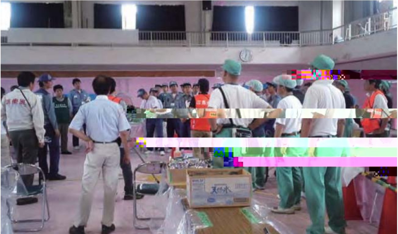
Preparation meeting for a temporary return home program (at a staging venue)