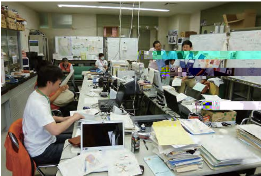
Meeting held at Fukushima Medical University each morning

I joined the activities for a temporary return home visit that was conducted in Kawauchi Village (dose measurement, provision of detailed explanations and advice, etc.), which was a very useful, personal experience. I would like to express my heartfelt thanks to all those involved at Hiroshima University, who since the outset of this disaster, have been unrelentingly committed to support activities from the perspective of the disaster victims, in spite of the unprecedented personal risks.