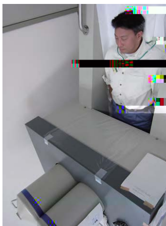
(left) Staff of Fukushima Medical University, Nagasaki University and the University of Tokyo at the Decontamination Ward