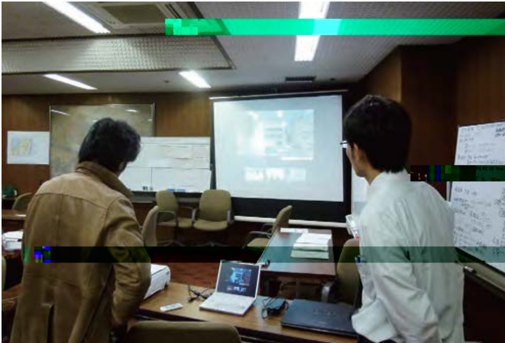
Holding a web conference (Hiroshima University Hospital)

hours since we first discussed the introduction of video conferences at OFC. Then, the J-Village and the Japan Association for Acute Medicine joined our web conferences. I believe that we should devise various means to share information in the future so that we have a flexible approach depending on the degree of damage to the infrastructure.