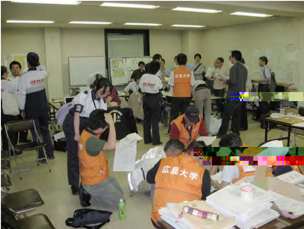
Meeting held at the Off-Site Center