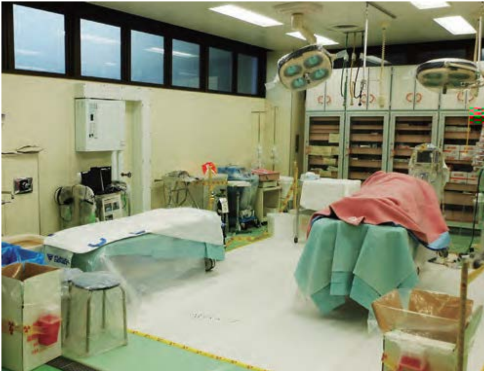
Treatment room at the Radiation Emergency Medical Care Unit in Fukushima Medical University Hospital

I sincerely hope that the evacuees can return to their old lives as soon as possible.