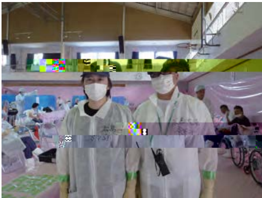
(upper left) Holding a briefing session for residents