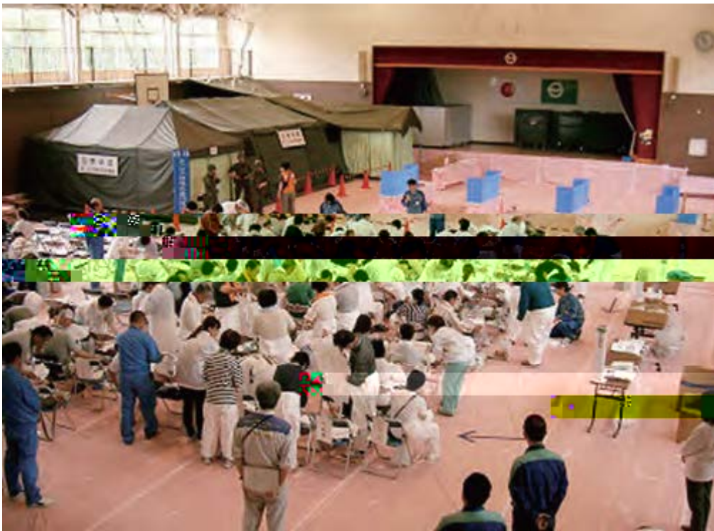
Staging venue for a temporary return home program before departure