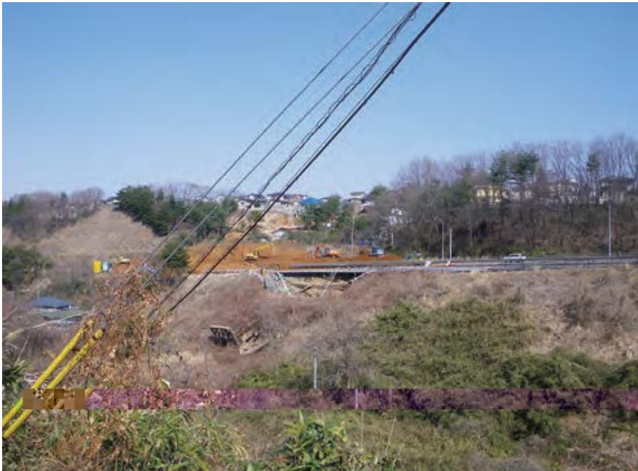
Around the Fushiogami Intersection in Fukushima City on March 13, 2011 (photographed by a friend of the author)

These circumstances were brought about due several unexpected events happened concurrently. Fortunately, since adverse emergency events did not occur, this situation did not lead to any problems. However anticipating future contingencies, I believe that personnel for guiding operations and public relations should have been secured separately so that someone and some vehicles were always available on stand-by in the event of possible emergencies.