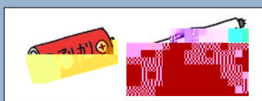
Batteries • Fluorescent Tubes • Incandescent Bulbs

Please dispose of button batteries after insulating them with cellophane tape etc.