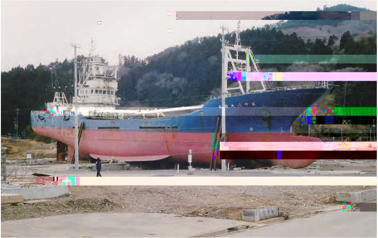
A large ship stranded next to Karakuwa Station on the Ofunato Line in the suburbs of Kesenuma City (photographed in March 2012)

at Hiroshima University, who participated in the volunteer activities, will enter the program. Within this program, I would like to stay involved in the reconstruction efforts of the affected areas by continuing to conduct fieldwork in Fukushima Prefecture.