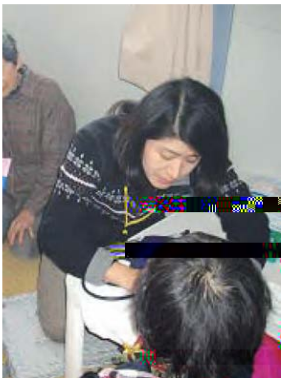
Checking health conditions at an assembly room of temporary housing in Minamisoma City

Since many of the medical facilities and their equipment were badly damaged, a new care service system needs to be developed. However, no matter how enthusiastic we are about the establishment of a new system of care, we will always be required to make adjustments in order to satisfy the immediate interest and needs of the people. At this point I feel like I have reached the limit of my ability to provide support, simply because I am unable to provide constant assistance from Hiroshima, which is so far from the affected areas.