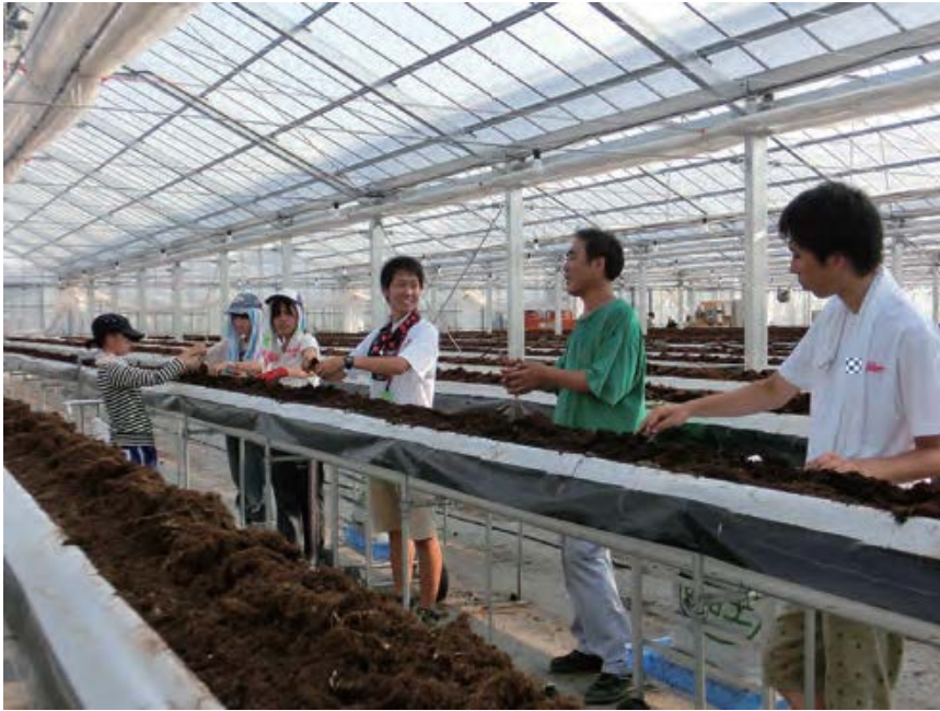
Volunteer members and a representative of a farm working together at the Yamamoto Strawberry Farm in Yamamoto Town

In affected areas, people are working long days to speed the reconstruct efforts. Some farmers strove to restore their tsunami-damaged strawberry farms because strawberries are the symbol of Yamamoto Town. In addition, we met high school students who undertook volunteer activities, with their student council playing a leading role, aimed at the reconstruction of affected areas. I hope that we will be able to continue providing emotional support to people in affected areas as well as supporting and encouraging the reconstruction efforts.