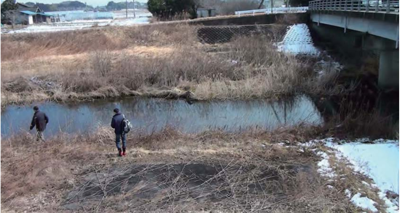
Sampling for the environmental radiation survey in Minamisoma City (March 2012)

In November 2011 and May 2012, we held debriefing sessions about the survey in Minamisoma city, which were attended by approximately 100 residents on each occasion.