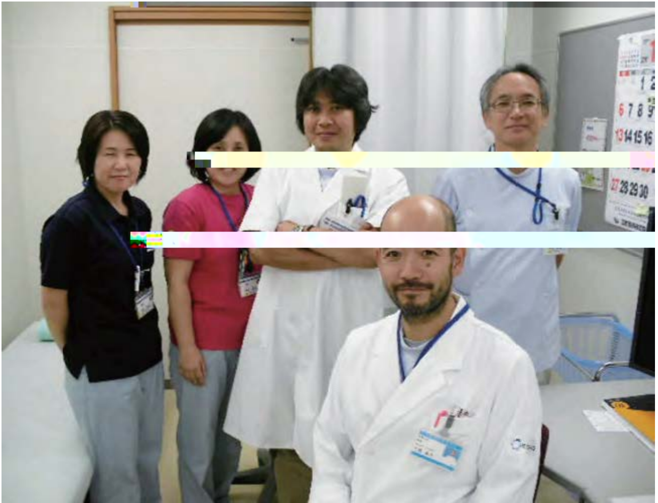
Physicians and nurses with whom the author conducted support activities (author in the center)