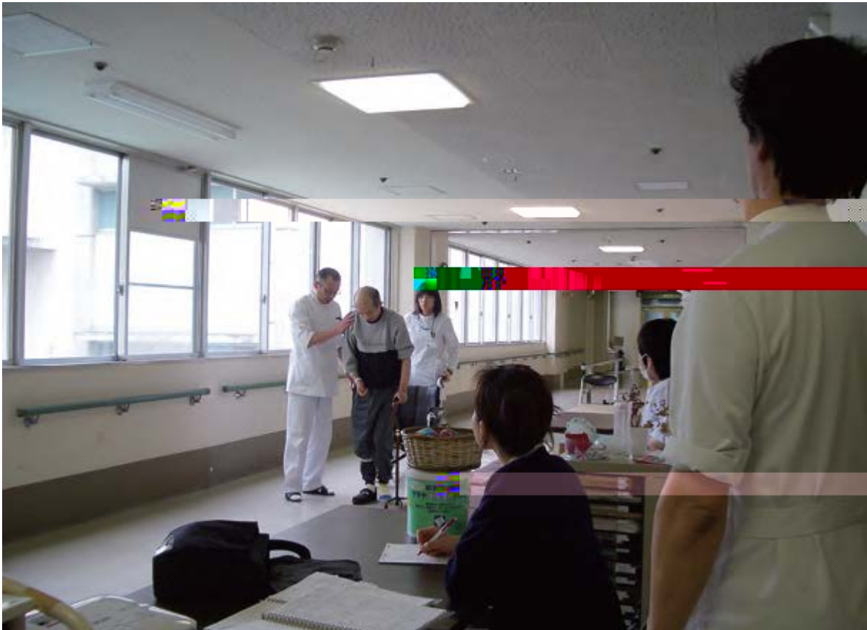
Review session for rehabilitation cases at the sub-acute rehabilitation ward