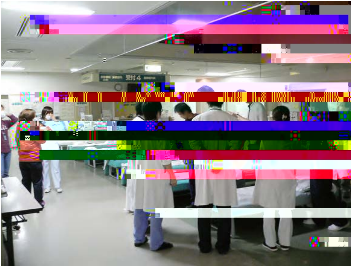
Making preparations for receiving sick and injured people

If public wireless LAN or Wi-Fi are available, they would allow us to connect to the Internet and in turn be able to obtain more accurate information in a timely manner (though batteries need to be secured).